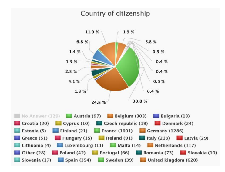
Figure 1: distribution of the country of citizenship of individuals participating in the open public consultation

In total, this public consultation received 5323 replies ; 5199 from individuals and 124 from organisations . Contributions were mainly sent by French, German and British citizens (see figure 2 for details), while organisations which took part in the consultation are mainly based in Germany, Belgium and France.